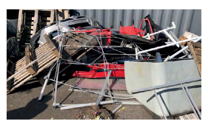
We will utilise our expertise in the waste management industry to ensure all site clearances are conducted in the most cost effective, compliant and safest way possible.